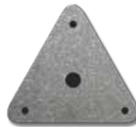
TRIANGLE MODEL 9