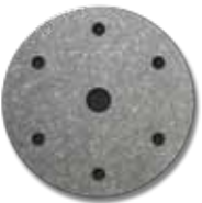
SIX-HOLE CIRCLE MODEL 5