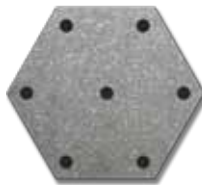
HEX MODEL 8