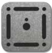
SQUARE MODEL 6