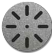
FLEX CIRCLE MODEL 7